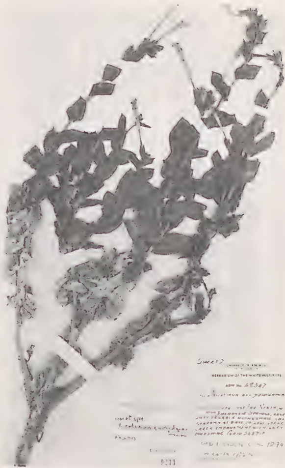
Fig. 2. Holotype of N. burbidgeae Symon 9294 (AD).